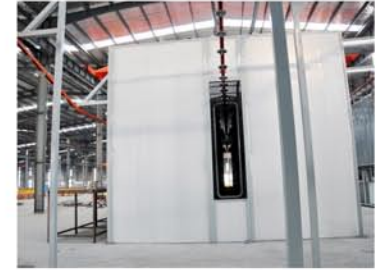
Powder spray booth room