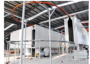
Powder coating line supplied by colo