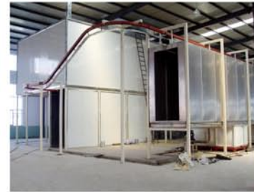
Tunnel curing oven spraying tunnel