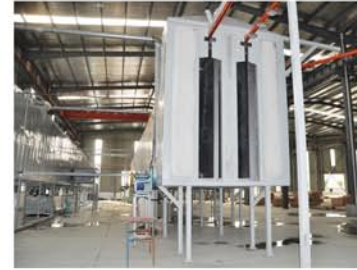
Tunnel curing oven and dry off oven